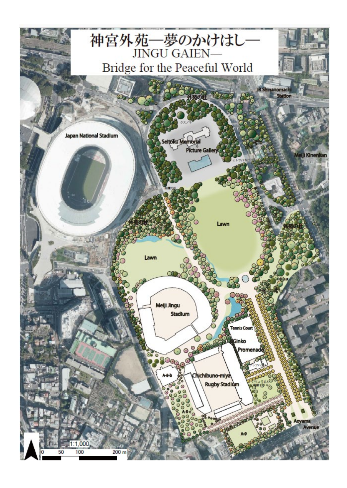
Fig. 2 – Alternative Proposal by ICOMOS Japan: Jingu Gaien--A bridge for the Peaceful World Created by Laboratory of Green Infrastructure in Research and Development Initiative, Chuo University.