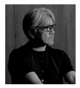
Musician, Ryuichi Sakamoto 2013